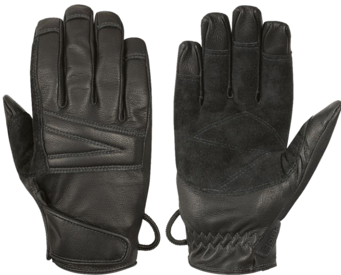
RENCY Short Black